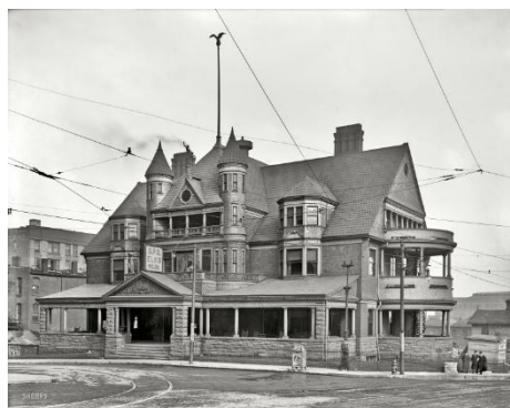
Kansas City, Missouri, circa 1906. "Elks Club." Welcome to B.P.O.E. 26

In the following meeting on May 22, 2025, we will be voting on them to be amended to our current by-laws.